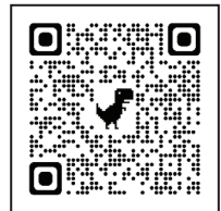
QR Code for IPark

For further assistance with purchasing parking permits, please contact us at: Phone: (951) 487-3707 Email: AdultEducationandNon-Credit@msjc.edu