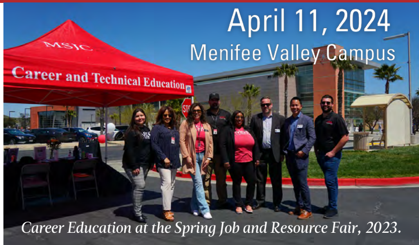
Career Education at the Spring Job and Resource Fair, 2023.

Don't miss out! Save the date and get hired at the Spring Job and Resource Fair on April 11.