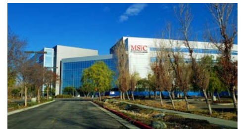
Temecula Valley Campus