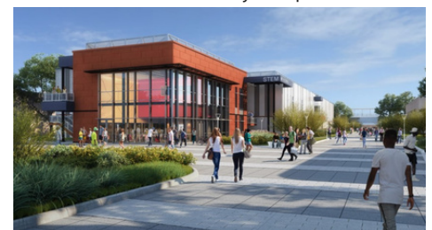
STEM Center Menifee Valley Campus