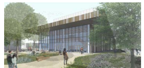
STEM Center San Jacinto Campus